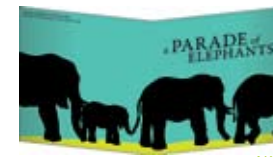
A Parade of Elephants