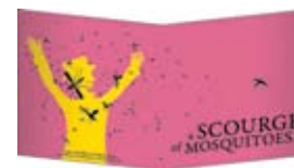
A Scourge of Mosquitoes