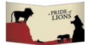
A Pride of Lions