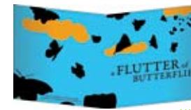
A Flutter of Butterflies