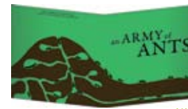
An Army of Ants

Collective nouns for animals of the alphabet