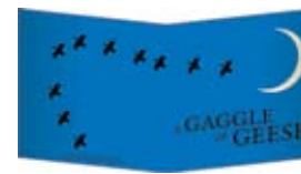
A Gaggle of Geese