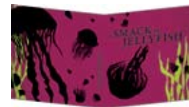
A Smack of Jellyfish