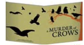
A Murder of Crows