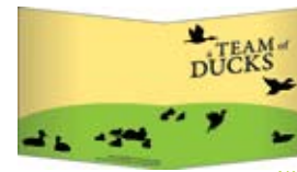
A Team of Ducks