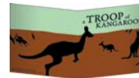
A Troop of Kangaroos