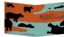
A Bloat of Hippopotamuses