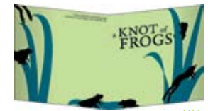
A Knot of Frogs