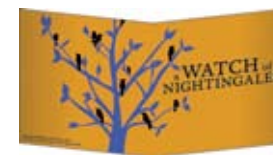
A Watch of Nightingales