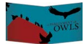
A Parliament of Owls