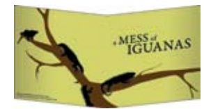
A Mess of Iguana